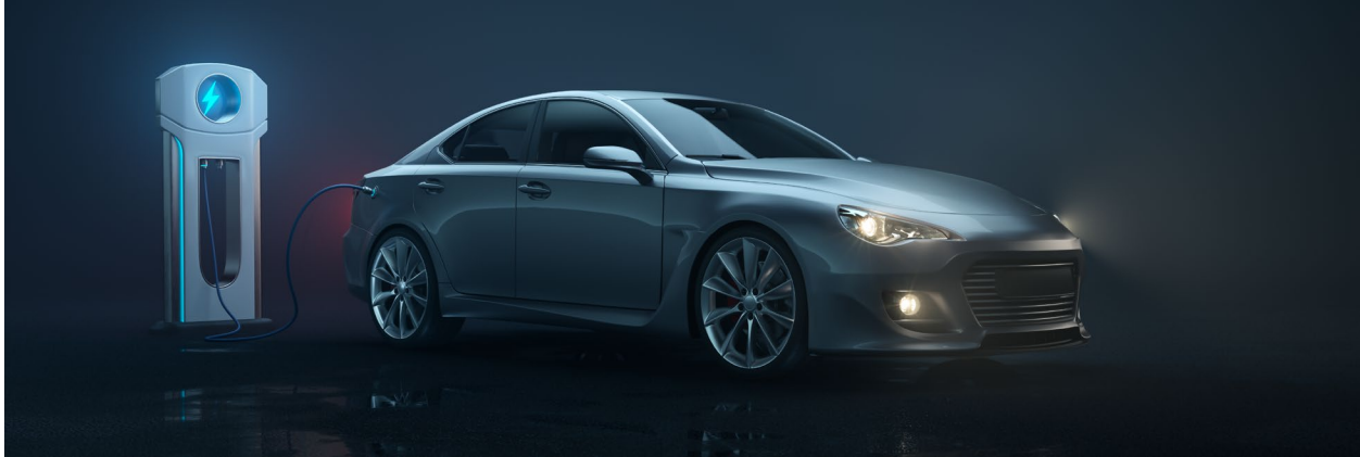
Fig. 1. Charging an EV